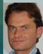
Sonnerly-Cottet Bertrand Lyon (FRA) Orthopaedic Surgeon, Centre Ortopedique Santy - FIFA Medical Centre of Excellence